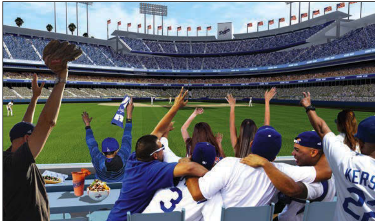
rendering courtesy of the Los Angeles Dodgers

The updated renderings also include a Centerfield Bar that will replace the tarp that stood above centerfield. The new structure will offer a viewing deck with a game perspective previously only enjoyed by way of television cameras. The centerfield improvements will house many new spaces that enhance the fan experience, including shaded areas where fans can watch the game while enjoying food and beverages, large screens for game viewing, interactive entertainment and several kids areas.