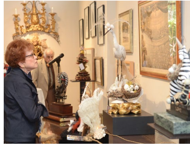
Guests enjoyed a reception and toured the gallery.