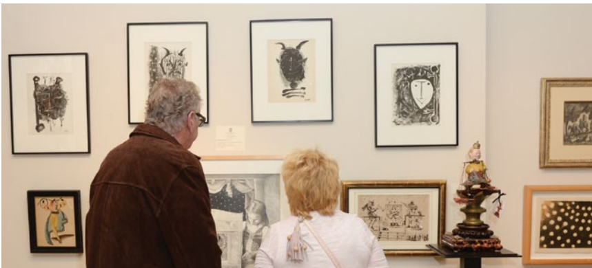
Exhibit at the Denenberg Fine Arts Gallery.